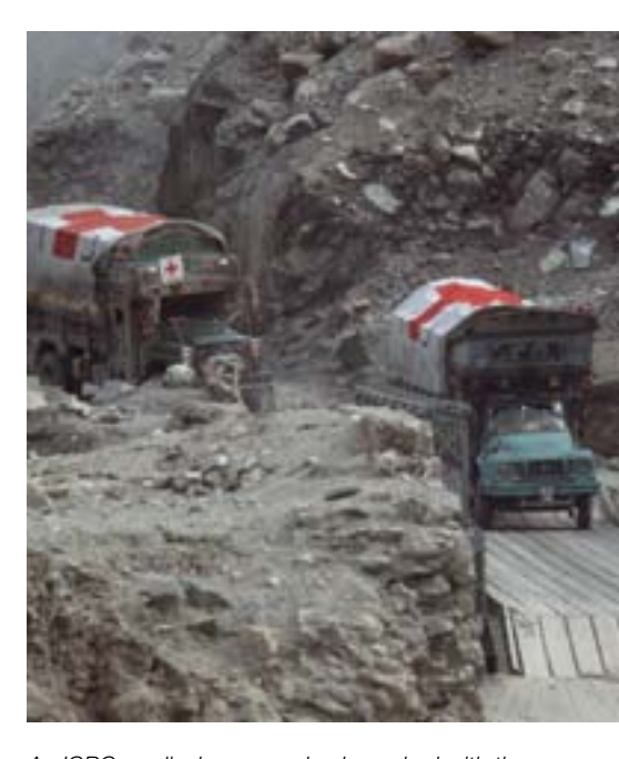
An ICRC medical convoy, clearly marked with the emblem, carries fresh supplies for a hospital in Afghanistan.

Many people depend upon the emblems to keep them safe in areas of conflict and many people owe their lives to the emblem by virtue of the respect that it commands throughout the world.